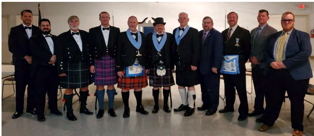
Participants in the Table Lodge Ceremony