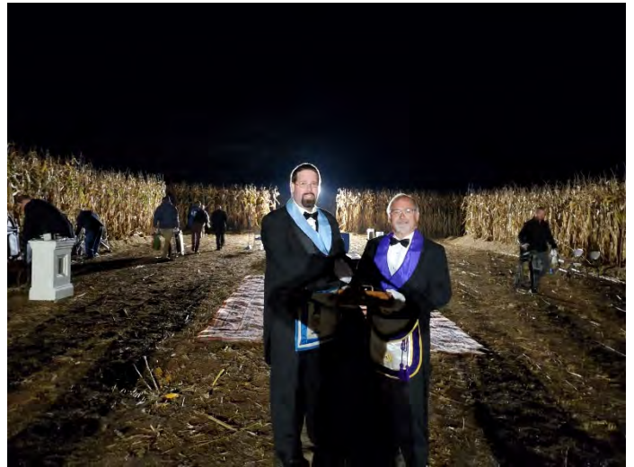
Orrstown Lodge No. 262 receives the District Traveling Gavel

A Stated Meeting of Orrstown Lodge No. 262 Free and Accepted Masons will be held at the Masonic Temple, 41 Stewart Place, Shippensburg, PA., on Thursday October 14, 2021, at 7:30 p.m. The program for the evening will be presented by Pennsylvania Order of the Eastern Star presented by 342 Martha Custis Chapter.