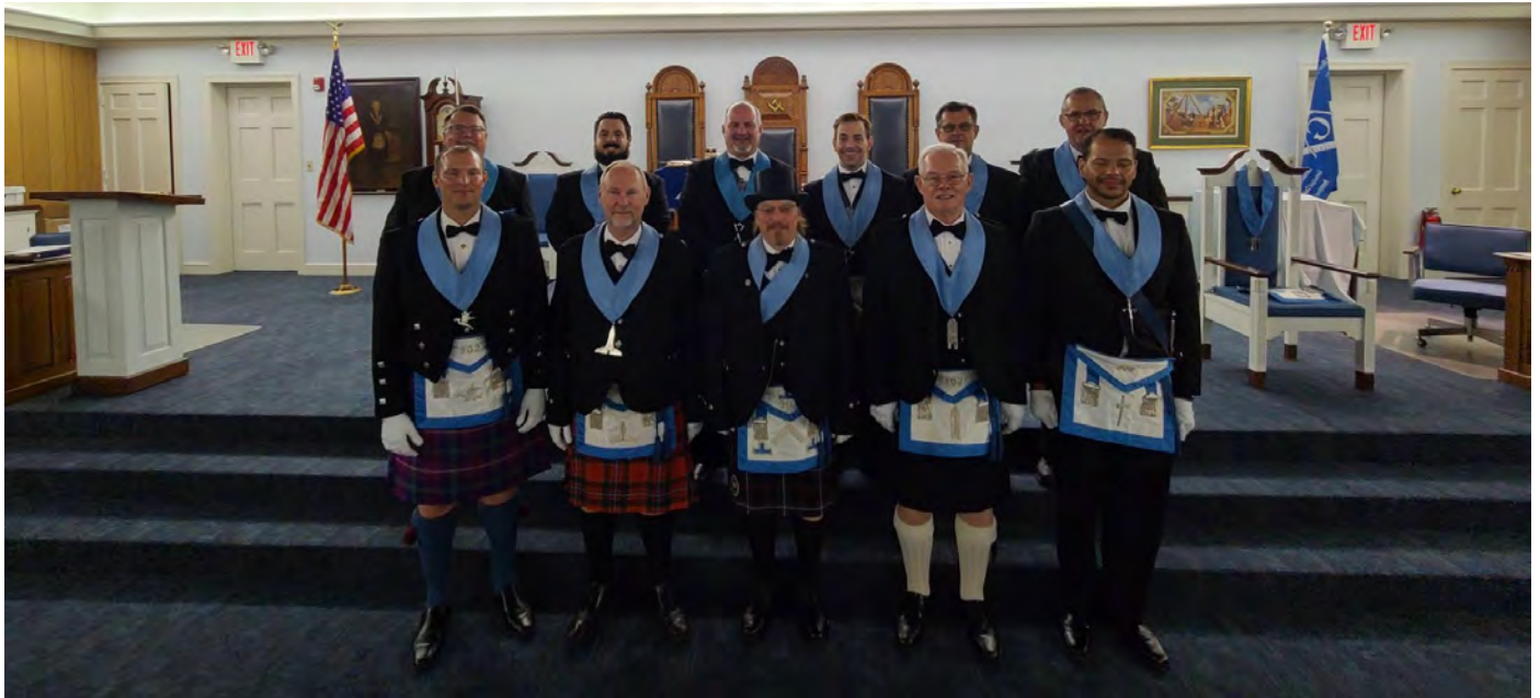
Lodge Officers for the Evening Business Meeting