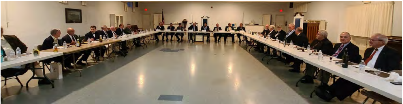
Brethren at the Table Lodge Ceremony