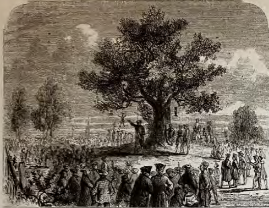
THE COLOSISTS UNDER LIBERTY TREE