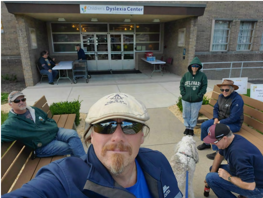
Dyslexia Center Fund Raising Walk

The lodge continues to host to our unofficial ZOOM toast meetings once a month, but they have been shifted to the third Wednesday at 9:00 p.m. The zoom meeting is purely social and a great time for Brethren to enjoy fraternal time. We invite all brethren to join us. Click on the following link to ZOOM, and feel free to join us on November 17 th .