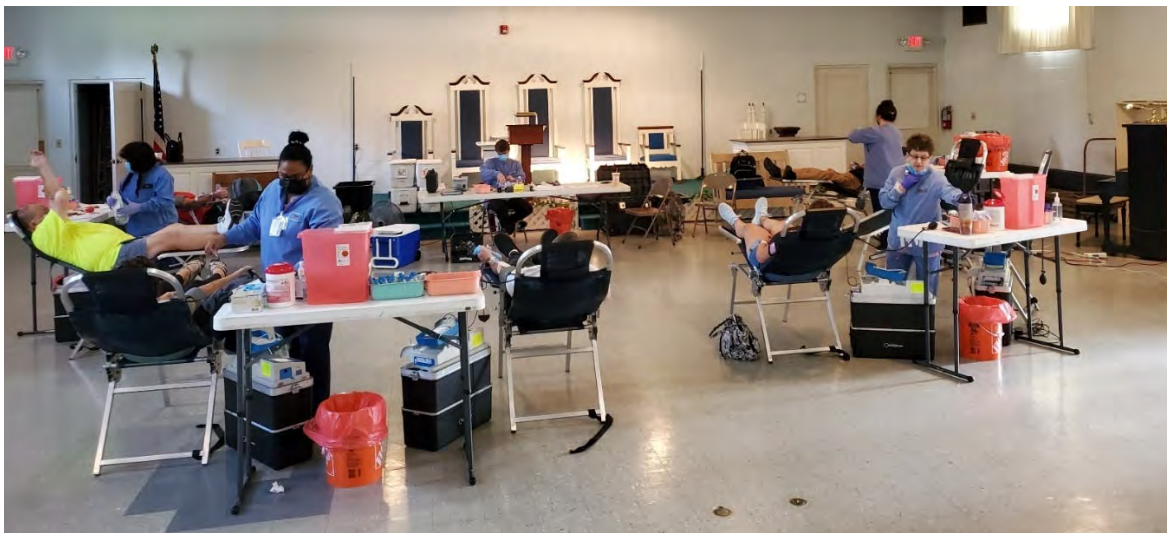
Lodge Blood Drive on October 8 th

The lodge hosted its third blood drive of the year on October 8 th . It was another successful event with over 40 pints of blood donated!