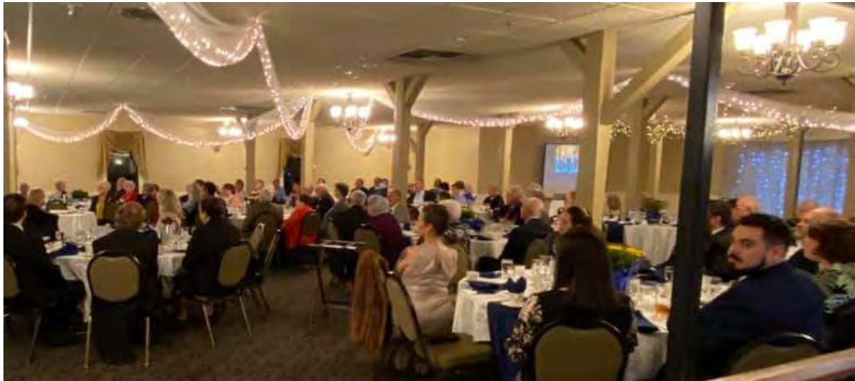
165 th Anniversary and Ladies Night Banquet