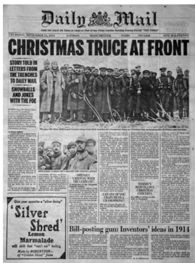
Participants: Soldiers from the United Kingdom, the French Republic, the Austro-Hungarian Empire, the German Empire, and the Russian Empire

The Christmas Truce occurred on and around Christmas Day 1914, when the sounds of rifles firing and shells exploding faded in a number of places along the Western Front during World War I in favor of holiday celebrations. During the unofficial ceasefire, soldiers on both sides of the conflict emerged from the trenches and shared gestures of goodwill.