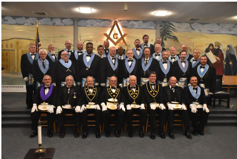
Grand Lodge Officers with all the Officers from the Third Masonic District