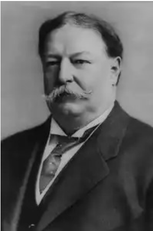
President William Howard Taft

In 1978, the Grand Master of Ohio made Glenn a Mason at sight, raising him to the degree of Master Mason. Due to his celebrity status as a Senator and astronaut, the ceremony was a significant event that saw hundreds of Masons attend. Bro. Glenn went on to receive the Scottish Rite degrees in the Valley of Cincinnati and was named Sovereign Grand Inspector General and became a 33rd degree Scottish Rite Mason, Honorary Member of the Supreme Council.